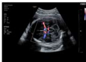
Fetal brain with S-Flow™